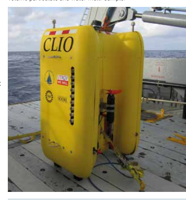
Fig. 3. Clio, a biochemical mapping autonomous vehicle, preparing for launch from the R/V Atlantic Explorer at the Bermuda Atlantic Time-series Study station.