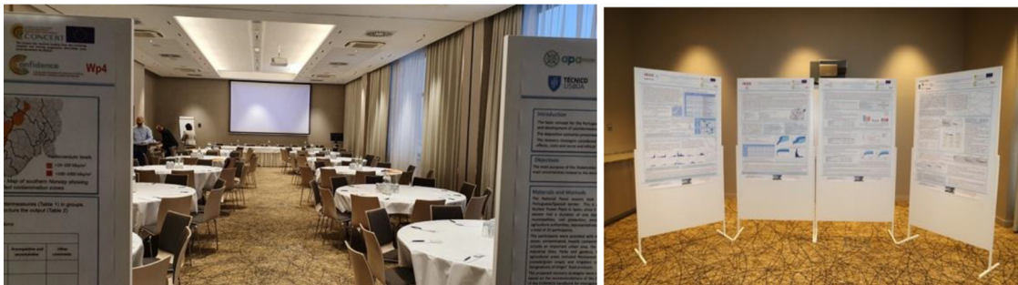
Fig. 3. Dissemination workshop facility.

discussions based on the deliverables of the CONFIDENCE project and adapted to the audience's need and wishes with focus on questions: