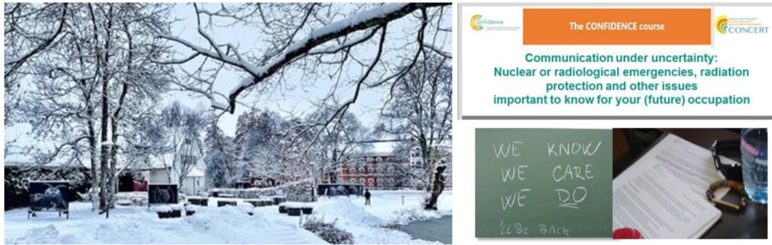
Fig. 2. Course location in Norway and snapshot from realisation.