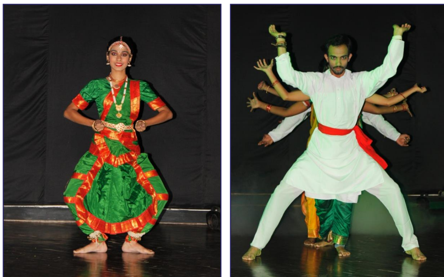
Figure 6: Cultural dance programme

For recreation, and to acclimatize the delegates to India and its culture, a cultural programme was organized on the second day of the workshop. The event included an audio-visual narrative about the different regions of India and dance performances by artists depicting various Indian states and their respective culture and traditions.