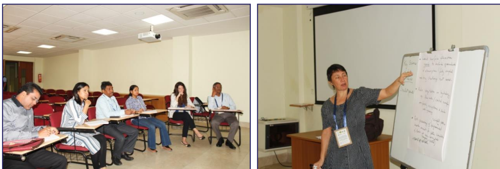
Figure 5: Breakout discussion groups

A summary of break-out group discussions can be found in Annex C.