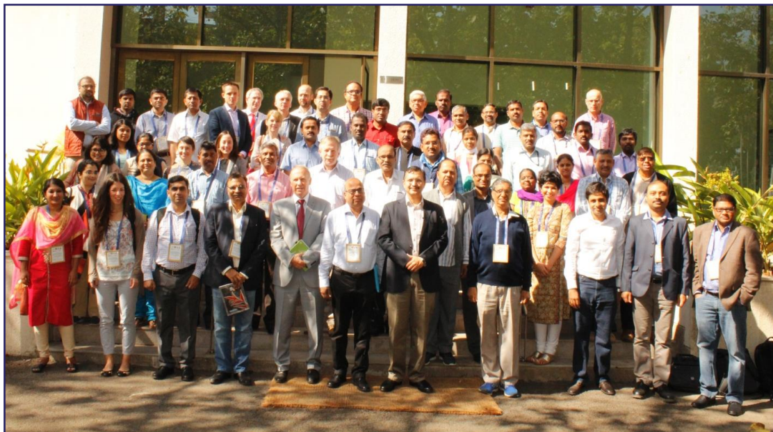
Figure 1: Participants at the IUKWC Workshop, 1 December 2016, Pune, India.