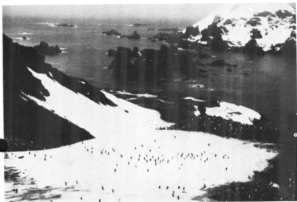
Fig. 2. Part of the large chinstrap penguin colony at Metchnikoff Point, Brabant Island. Photographed 29 December 1983.