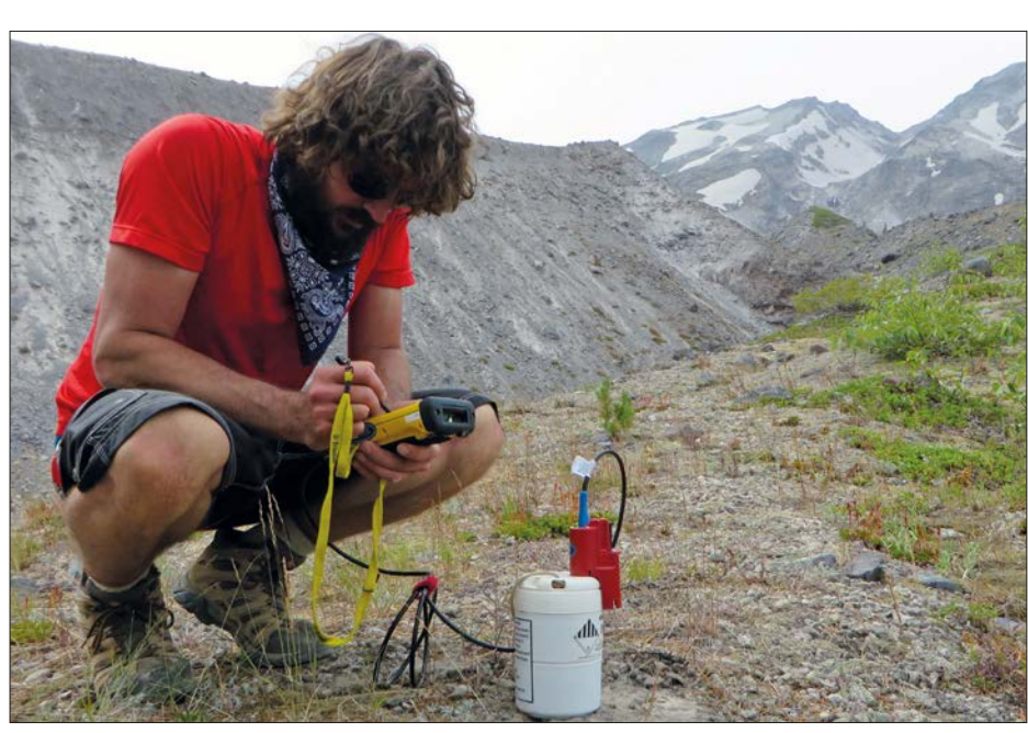
1 Small, cheap and remarkably useful: modern high-frequency seismic nodes are increasingly popular for deployments in remote areas and novel seismological situations.

In 1883, John Milne postulated that earthquake energy could be recorded at great distances (Milne 1883). This was proven in 1889 when a recording of a teleseismic earthquake (from Japan) was made by Ernst Von Rebeur-Paschwitz on a seismometer in Potsdam, Germany (Von Rebeur-Paschwitz 1889). Von Rebeur-Paschwitz soon realized that a set of seismometers deployed at stations globally could enhance