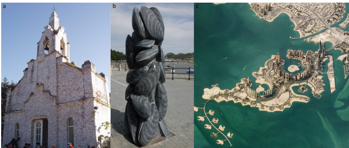
Figure 1 Examples of shellfish used in spiritual, emblematic or cultural contexts. (a) The shell church, covered in scallop shells at La Toja, Spain; (b) Sculpture of mussels in the mussel producing town of Conwy, Wales, UK; (c) Coastal development designed in the shape of an oyster: The Pearl, Qatar.

Bivalves have an archaeological and historical value, with empty shells found in midden piles which have been dated to between 8,000 and 7,000 years (Rollins et al. 1987; Roosevelt et al. 1991). Among the indigenous peoples of the Americas who lived on the eastern coast, they commonly used pieces of shell as wampum (small cylindrical beads strung together). The shells were cut, rolled, polished and drilled before being strung together and used for personal, social and ceremonial purposes as well as currency (Dubin 1999). The Winnebago tribe from Wisconsin had numerous uses for mussels, using them as utensils and tools. They notched them to create knives and graters and carved them into fish hooks and lures as well as powdering shell into