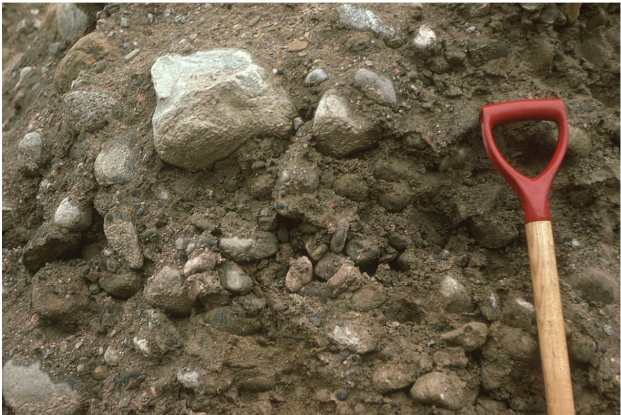
Figure 97. Poorly-sorted cobble gravel within the core of one of the Littlemill eskers in c. 1990, looking south-west.