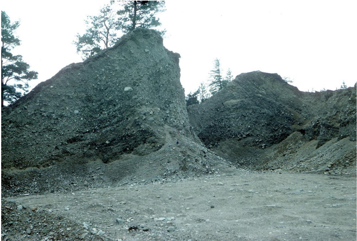
Figure 96. Section across one of the Littlemill eskers in c. 1990, looking south-west.