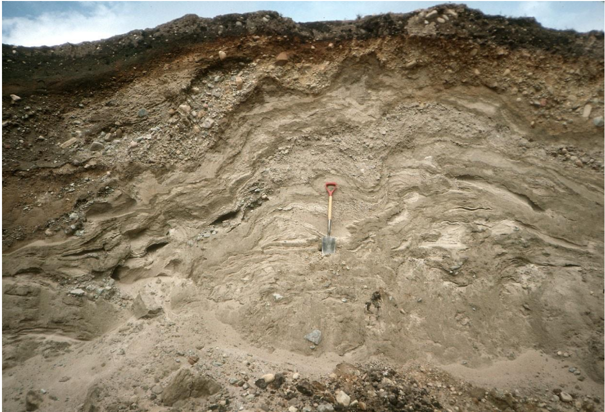
Figure 99. Section through undulating, kettled deposits of sand and gravel formerly lying between the Littlemill eskers and Mid-Lairgs farm in c. 1990, looking east.