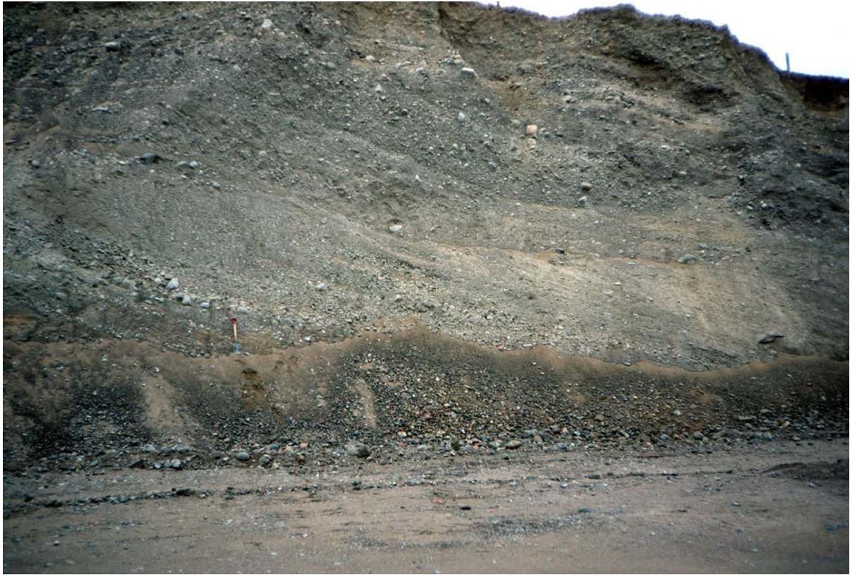
Figure 98. Longitudinal section through one of the Littlemill eskers in c. 1990, looking north-west.