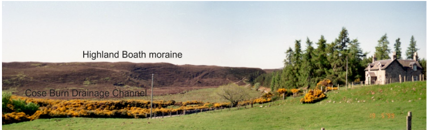
Figure 105. Lateral moraine ridge on the southern side of the ice-marginal drainage channel now occupied by the Cose Burn, looking south-east from Balmore [NH 891 451].

probably formed in contact with the ice, but the slope has been steepened by glaciofluvial and postglacial fluvial erosion. The southern margin of the morainic deposits is much more diffuse, with minor ridges merging with mounds of bedded glacial sand and gravel typically rising to c. 5 m above the surrounding land surface. Exposures in the top of the moraine indicate that is composed, at least in part, of poorly stratified sandy cobble and boulder gravel.