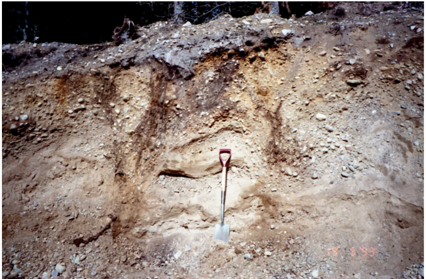
Figure 106. Cryoturbated fabric within kettled glacial outwash gravels exposed in the disused Highland Boath pit in 1999. Spade 0.9 m long.