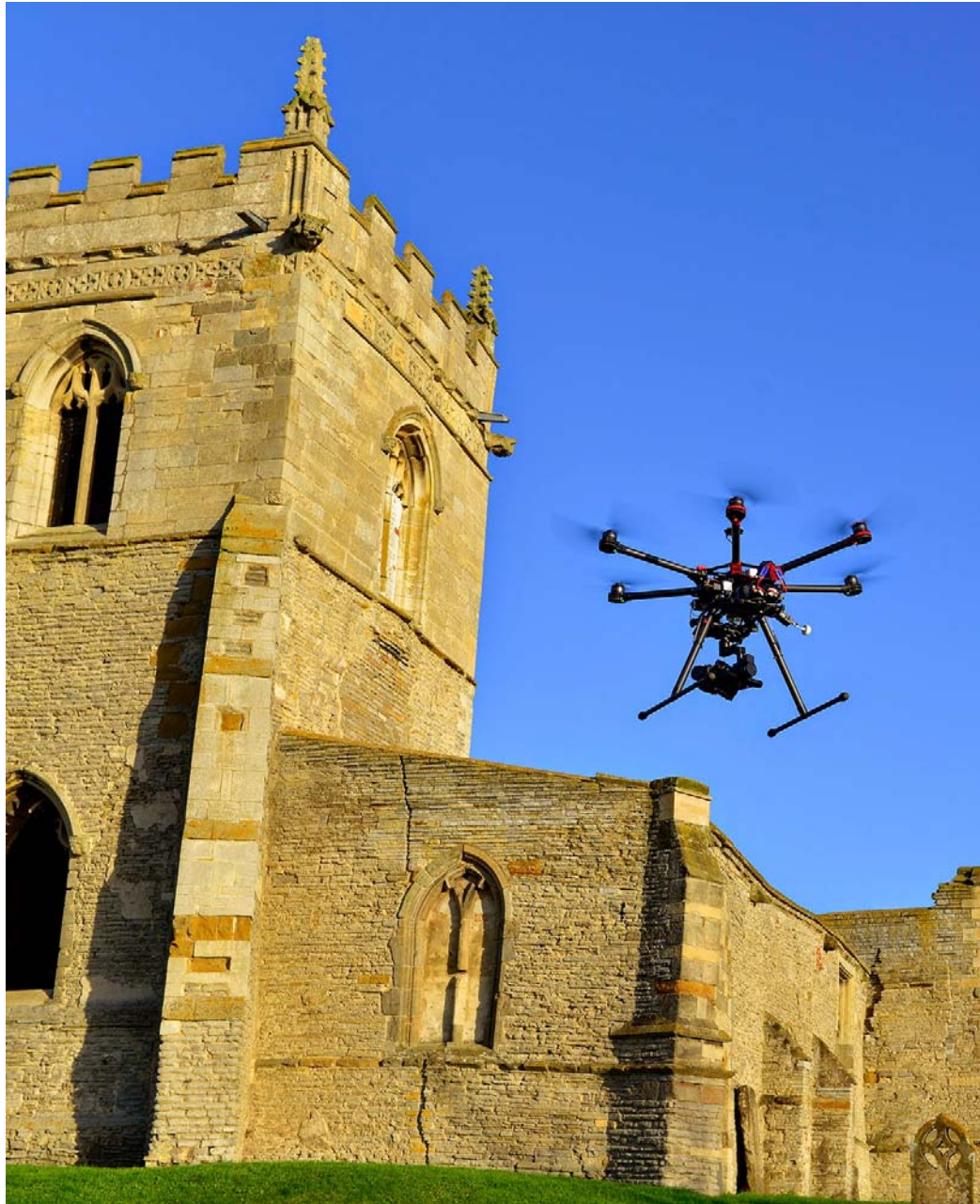
The new Hexacopter