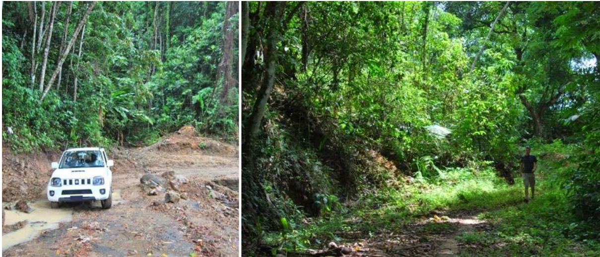
Left: Some conditions typical of the smaller roads. Right: Colm trying to find a way through a road blocked by landslide debris and vegetation – now only passable on foot.

St Lucia is still a very active environment when it comes to landslides as Colm explains: “We were staying near the Pitons and we heard a rock fall overnight. The next day we were able to find the scar where the rocks had come from”.