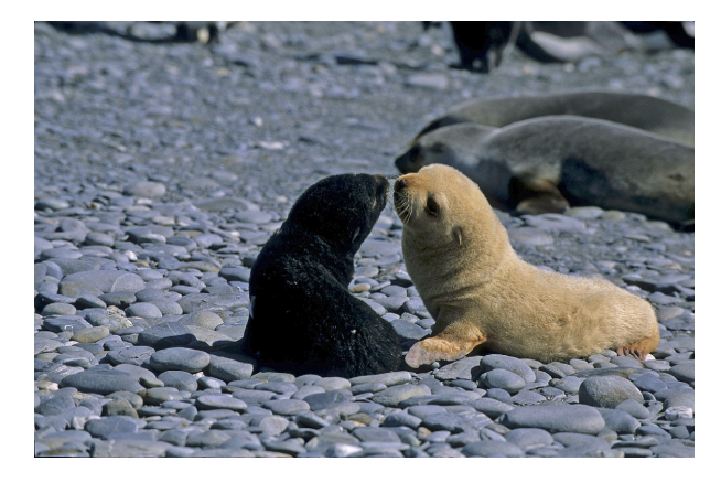
Figure 1. Antarctic fur seal pups at South Georgia, showing the wild-type (left) and hypopigmented (right) phenotypes.

Antarctic fur seals are relatively convenient for studying the molecular genetics of pigmentation for three main