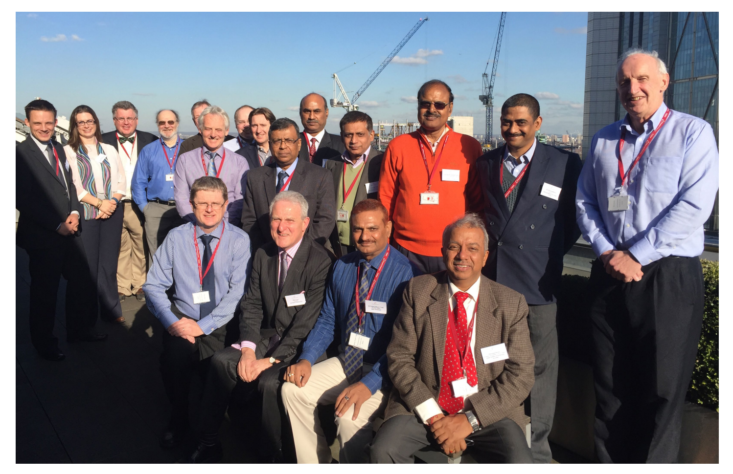
Figure 5 Delegates on Day 2.

An afternoon water industry session allowed a number of UK consultants, contractors and businesses to meet the Indian delegation and give short presentations on their capabilities. The companies presenting included: