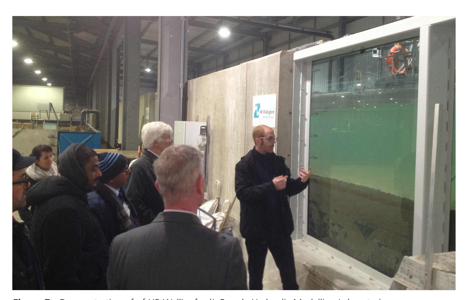
Figure 7 Demonstration of of HR Wallingford's Froude Hydraulic Modelling Laboratories.