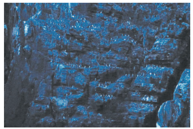
Plate 5. Guillemots still ashore on the Isle of May at 08:10 hr on 31 October 2015.