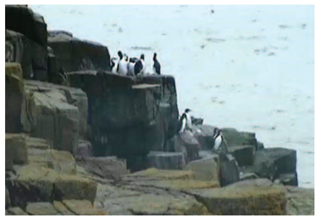
Plate 6. Guillemots at the secondary monitoring site as seen via the webcam on the Isle of May at 10:00 hr on 8 December 2015.

of the images and on a few days thick haar prevented anything being seen. Fortuitously, staff from the Centre for Ecology & Hydrology and Scottish Natural Heritage (SNH) and visitors to the Isle of May Bird Observatory were on the island when these problems occurred and were able to check if Guillemots were ashore. However, on these occasions we could not obtain an index of the numbers present nor an estimate of when the birds departed. Observations ceased on 20 December when the power supply on the island failed and there was nobody present to make direct observations.