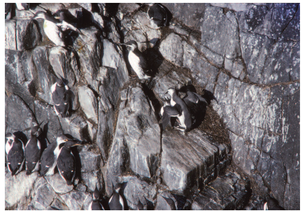
Plate 3. Guillemots in winter plumage mating at a nest-site on the Isle of May, 21 October 1982.

Checks were made throughout the day to determine when the birds finally departed. Although the camera and the system for transmitting signals to the Scottish Seabird Centre are very robust, winter conditions can cause problems. Thus, during autumn 2015 occasional power and equipment failures resulted in a few breaks in transmission, spray from gale-driven waves reduced the clarity