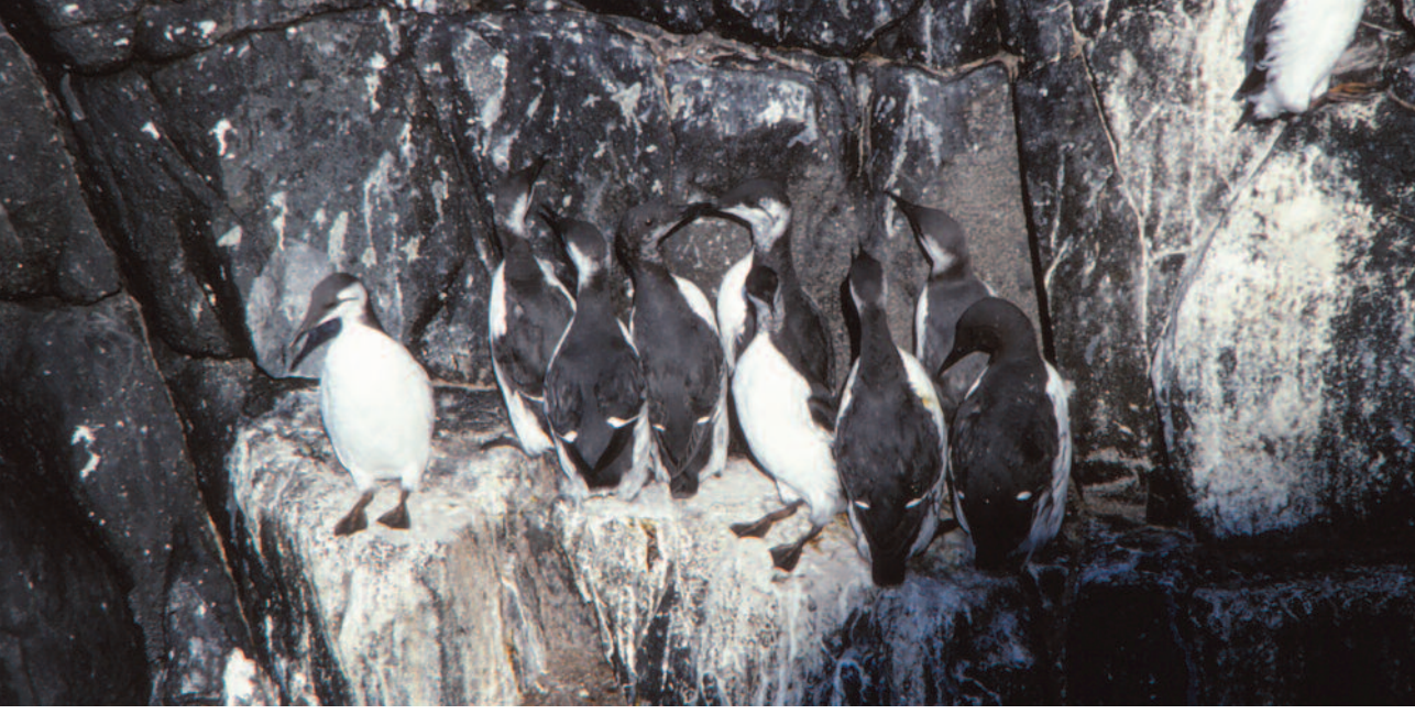
Plate 2. Guillemots on the Isle of May, 21 October 1982 showing a range of plumages from full winter (extreme left) to almost full summer (extreme right).