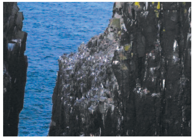
Plate 4. Guillemots ashore in the area monitored by the Scottish Seabird Centre's webcam at 06:55 hr on 29 October 2015.