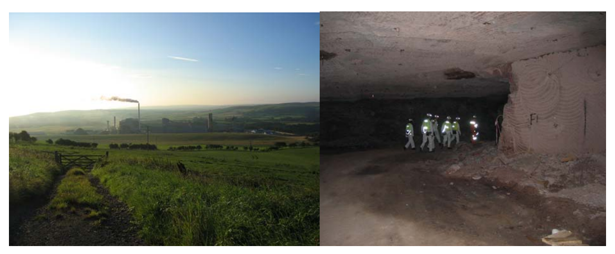
Figure 6. Boulby potash mine and underground workings, North York Moors National Park.

Potash production was nearly 1 million tonnes refined KCl in 2005, with a record output of 1.04 million tonnes in 2003. The Boulby Mine is the UK's only potash mining operation. Two other proposals to extract potash in North Yorkshire, one of which involved solution mining, were permitted in the late 1960s, but were never finally implemented.