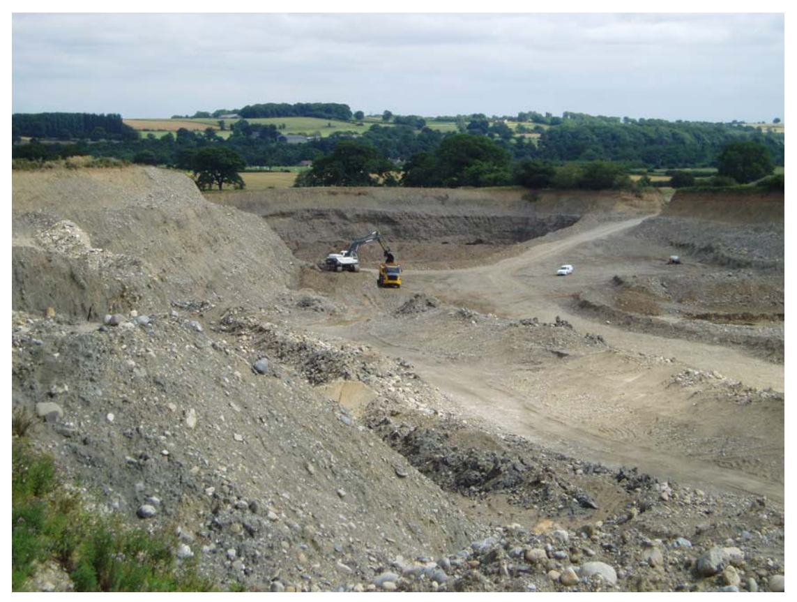
Figure 3. Marfield Quarry, Masham, North Yorkshire