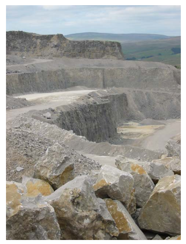
Figure 4. Horton Quarry, Settle, Yorkshire Dales National Park

The Carboniferous limestones of the northern Pennines contain thick sequences of very pure (>97 per cent CaCO<sub>3</sub>) limestone associated with other units of more variable chemical quality. The most consistently pure limestones are found within the Malham Formation and equivalent beds. These crop out widely between Ingleton and Grassington but further north they are largely concealed beneath limestones of lower and more variable quality. The Cove Limestone, forming the lower part of the Malham Formation, is chemically very pure and the overlying Gordale Limestone is also characterised by high-purity limestones. Local variations in rock quality may result from dolomitisation, silicification, lead-zinc mineralisation and clay contamination related to faults and fractures. However, the Malham Formation forms a thick resource of high-grade industrial limestone. Limestone for industrial use has been produced from several limestone quarries in the past but currently all limestone is used as aggregate.