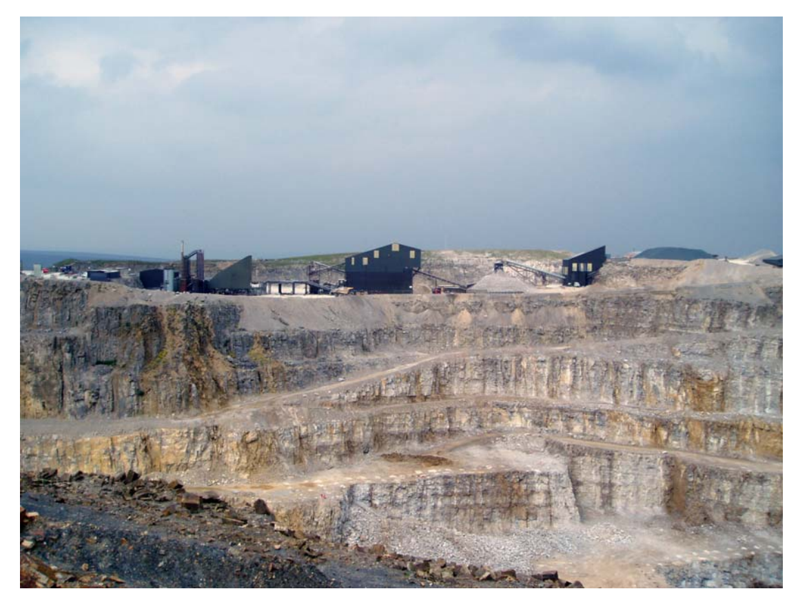
Figure 3. Coldstones Quarry, Pateley Bridge, North Yorkshire.

Jurassic rocks occur extensively in the North York Moors and adjacent areas. Limestones only form part of the sequence which also contains clays, siltstones and sandstones. The limestones, which are generally soft, friable and porous, occur in units which are usually relatively thin and may be laterally impersistent. Certain limestone units, however, such as the Upper Jurassic Malton Oolite Member of the Coralline Oolite Formation, which flanks the Vale of Pickering, are sufficiently indurated to produce good quality aggregates. The Malton Oolite is an impure limestone with high and variable silica contents and is quarried at several sites for general-purpose crushed rock aggregate. Locally, at Spaunton Quarry, it is suitable for producing coated roadstone, although the permission at this site which is within the National Park expires in 2007 and the quarry will close. The Coralline Oolite is shown on the map.