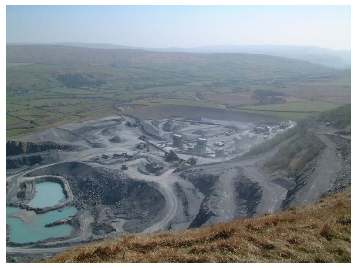
Figure 2. Arcow Quarry, Settle, Yorkshire Dales National Park