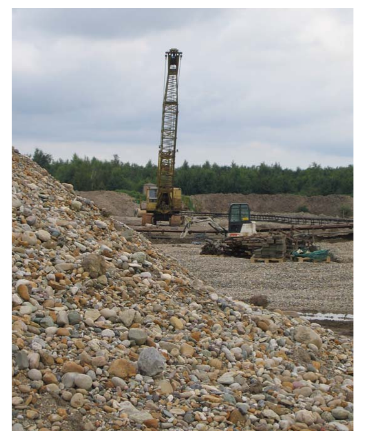
Figure 1. Wykeham Quarry, Scarborough, North Yorkshire.

Sand and gravel resources occur in a variety of geological environments. In North Yorkshire these resources occur mainly within superficial deposits, subdivided into river sand and gravel, glacial deposits, glaciofluvial, blown sand and beach deposits.