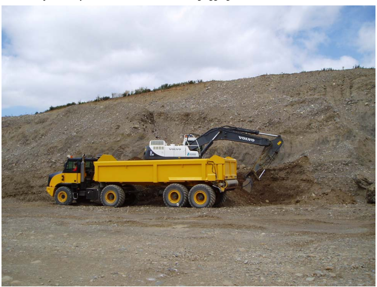
Figure 2. Crosslands Lane Quarry, North Cave. Vale of York Gravels.

The deposits around Pocklington form the Pocklington Gravel Formation, and these gravels contain an abundance of chalk and flint pebbles, with some Jurassic limestones and in one place a large amount of ironstone pebbles (ca. 10 per cent). Average clast composition is 75 per cent well-rounded chalk, 15 per cent sub-angular flint, plus 10 per cent accessory lithologies. The deposit is about 1 m thick on average. South of the Humber, significant deposits of glaciofluvial sand and gravel occur between Habrough and Laceby, where up to 15 m of well sorted sand with interbedded chalk and flint gravels overlie tills.. The high chalk, shell and coal contents of some of these deposits may restrict their use as concreting aggregate.