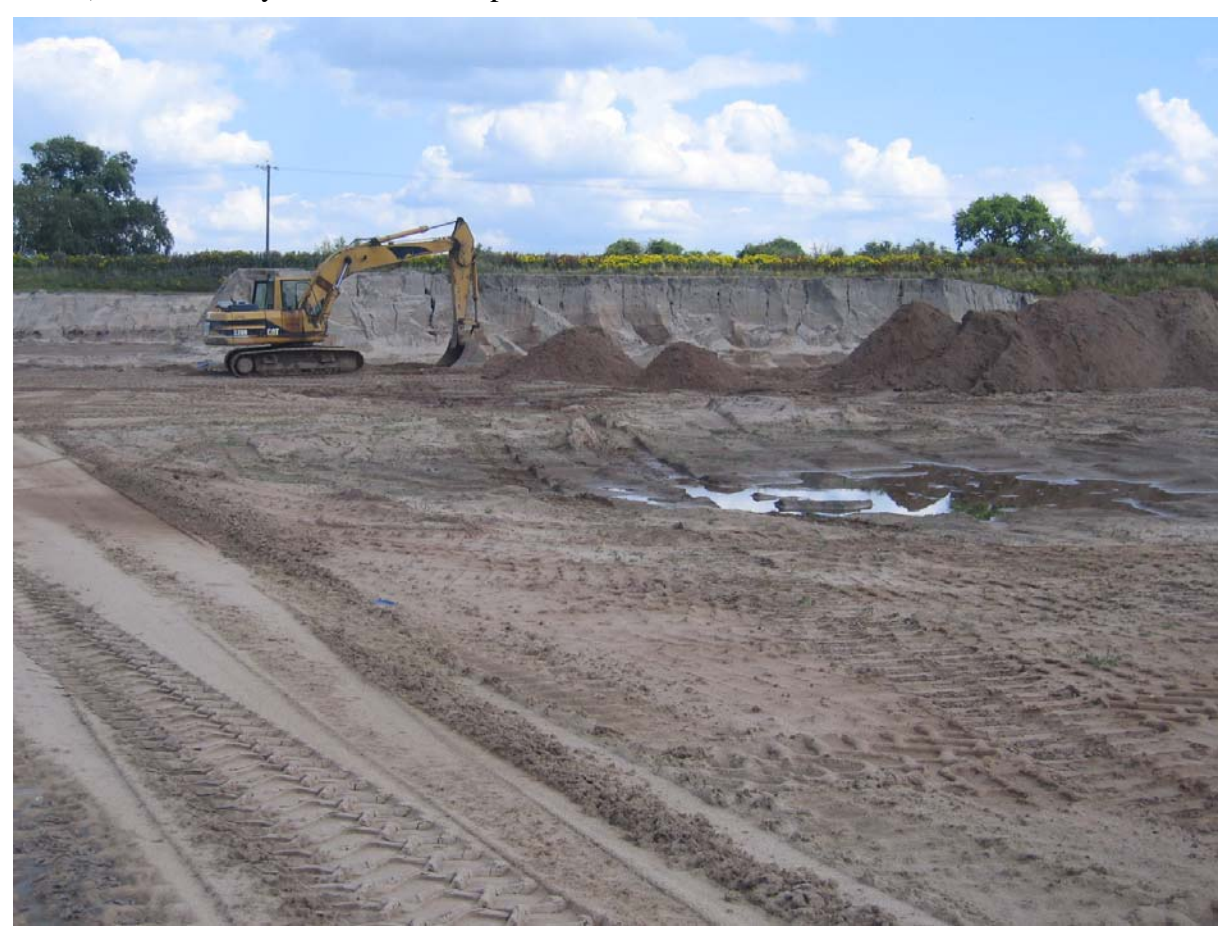
Figure 3. Recent blown sand deposits at Cove Farm Quarry

These deposits are generally composed of fine- to medium-grained sand with a mean fines (<0.063 mm) content of around 8 per cent. The sand comprises sub-rounded to well-rounded quartz grains. These deposits are believed to be largely of late Quaternary age resulting from aeolian reworking of fluvial and glaciofluvial sands, particularly those associated with the Vale of York drift deposits, including the Beighton Sands Formation. The most favourable sites for blown sand accumulation are along the lower slopes of major west-facing escarpments. Thickness is very variable, with up to 6 m being recorded around Messingham and Fonaby but generally thickness is less than 2 m, with extensive areas of sand less than 0.3 m thick. The Blown Sand deposits are mainly worked as a source of silica sand around Messingham (see above) and at Haxey for mortar sand production.