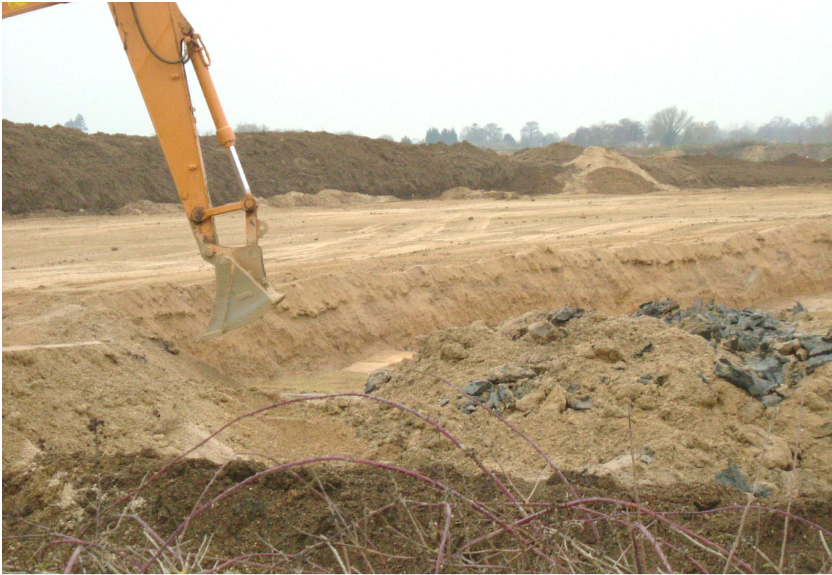
Figure 1 Sand and gravel extraction from River Thames Terrace Deposits at Kent End Quarry, Cotswold Water Park Complex, Moreton C. Cullimore (Gravels) Ltd.

underlying present day alluvium. They are of late Anglian to Devensian age. River terraces occur at several levels in most of the major valleys in the county flanking the present floodplain, particularly associated with the River Thames, the Bristol River Avon near Bath and the Salisbury River Avon. The Thames river terraces are more extensive and generally thicker than those on the other major rivers in Wiltshire, and therefore constitute a greater resource.