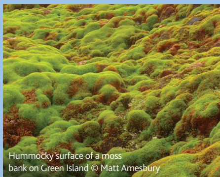
Hummocky surface of a moss bank on Green Island