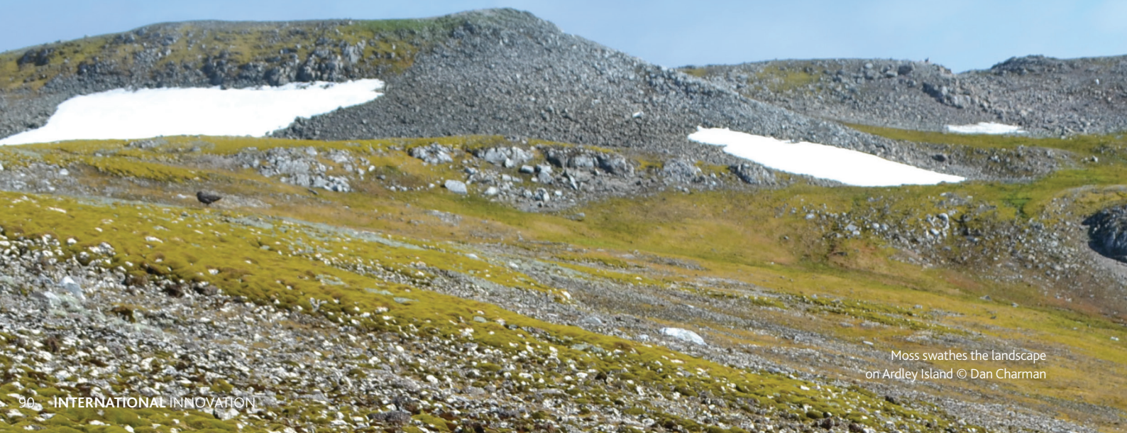
Moss swatches the landscape on Ardley Island