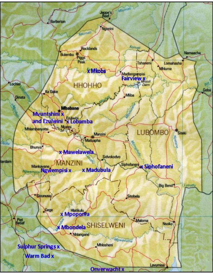
Figure 1. The Swazi thermal spring locations and adjacent Thermal sources in South Africa