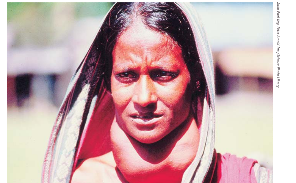
Woman suffering iodine deficiency related goitre

People suffer serious illness if their local soil provides either too little or too much of particular minerals or elements. Geochemists can show how these substances are distributed, and help discover how minerals are taken up into crops and then animals and people, as well as investigating what could be helping or hindering these processes. Together, geochemists and medical specialists are helping identify and manage health problems like mineral deficiencies associated with the rocks in our diets. Over the last few years, the British