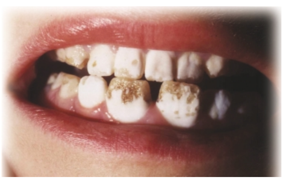
The brown pitting and staining of teeth indicative of dental fluorosis caused by high dietary fluoride intake.

which aims to improve water quality through reduction of fluoride concentrations in groundwater. The project involves partners from the Netherlands, Moldova, Ukraine, Hungary, and Slovakia.