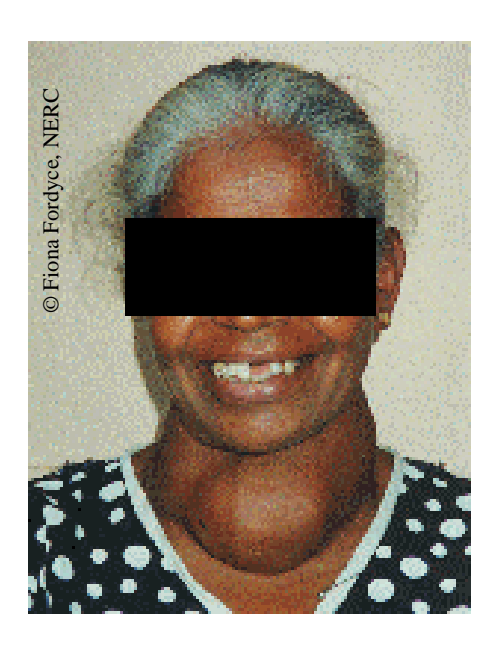
Fig. 1. Sri Lankan woman suffering from the iodine deficiency disorder goitre.