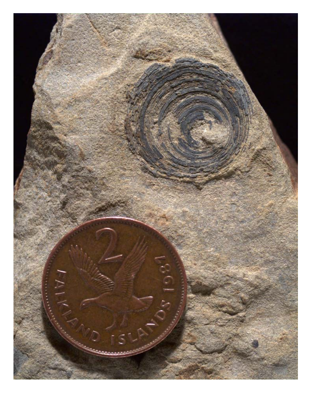
Plate 5. LX1015. A flattened example of the brachiopod Orbiculoidea falklandensis . Devonian, Fox Bay Formation. Caneja Creek, Port Salvador, East Falkland [51° 51' South, 58° 16' West]. BGS image number P511907. Illustrated in figure 13 of Stone and others (2005). Coin is 2.5 cm in diameter.