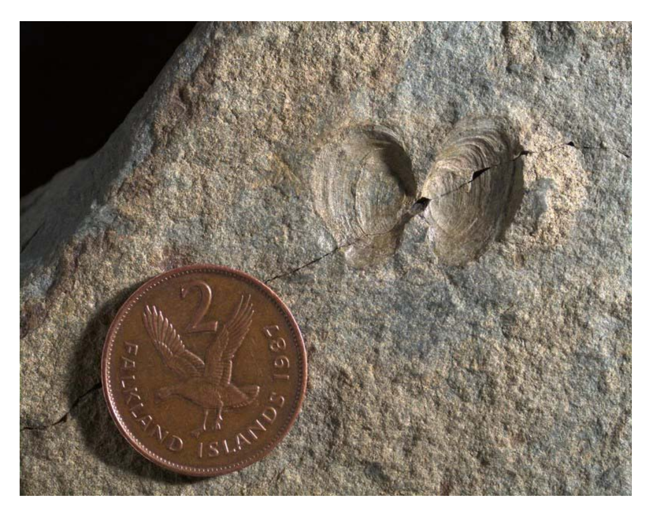
Plate 8. LX1010a. Concave impression of a splayed pair of conjoined ("butterflied") bivalve shells: Palaeanodonta cf. P. dubia (Amalitsky). Permian, Brenton Loch Formation. Rory's Creek, Lafonia, East Falkland [51° 55' 44" South, 58° 53' 48" West]. BGS image number P511904. Illustrated in figure 5 of Stone and Rushton (2003). Coin is 2.5 cm in diameter.