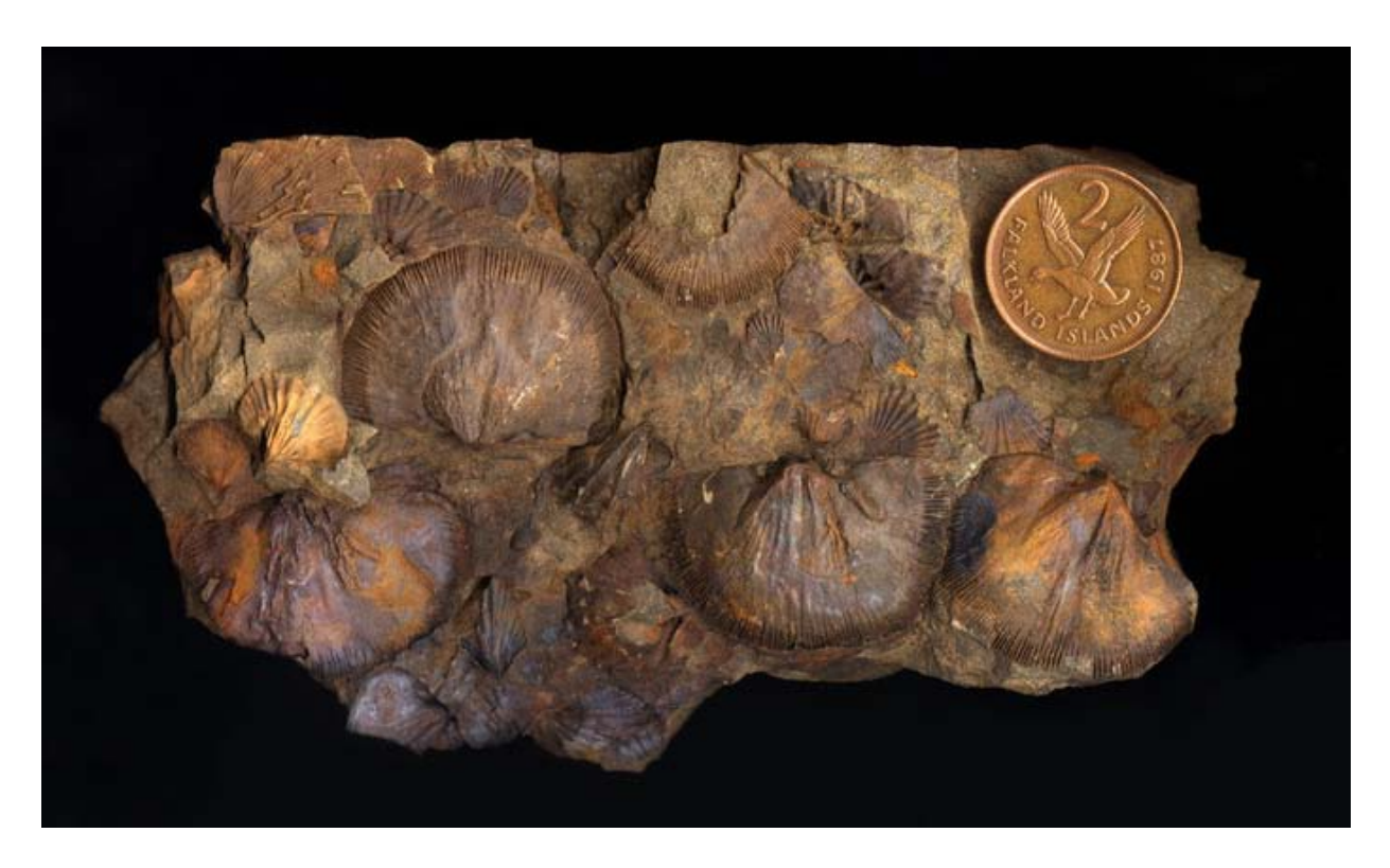
Plate 1. LX1011. Internal moulds of the brachiopod Schellwienella sulivani and the smaller species Australocoelia palmata . Devonian, Fox Bay Formation. Fox Bay, West Falkland [51° 57' South, 60° 05' West]. BGS image number P100659. Illustrated in figure 13 of Stone and others (2005). Coin is 2.5 cm in diameter.