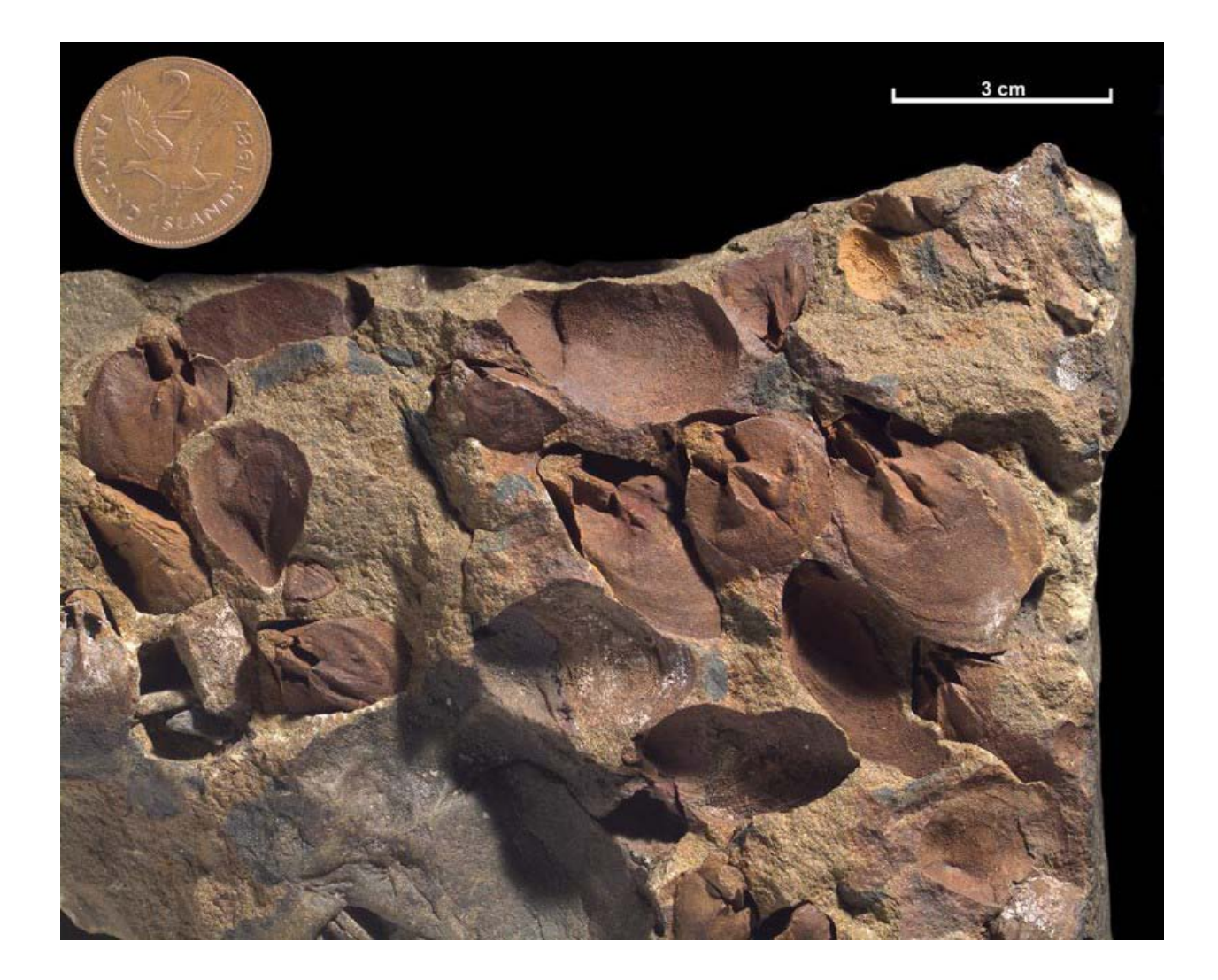
Plate 4. LX1014. Internal moulds and external impressions of the brachiopod Pleurothyrella falklandica , with the pygidium of a small calmoniid trilobite. Devonian, Fox Bay Formation. Dan's Shanty Creek, Port Salvador, East Falkland [51° 32' South, 58° 12' West]. BGS image number P573120. Illustrated in figure 13 of Stone and others (2005). Coin is 2.5 cm in diameter.