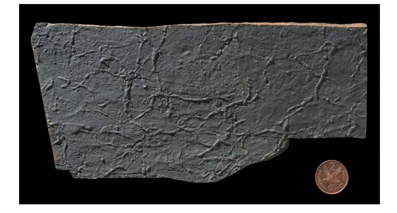
Plate 10. LX1024. Bioturbated black mudstone from the Terra Motas Member, Brenton Loch Formation. Canada Runde Quarry, East Falkland [51° 49' South, 58° 41' West]. BGS image number P549538. Illustrated in figure 39 of Stone and others (2005). Coin is 2.5 cm in diameter.