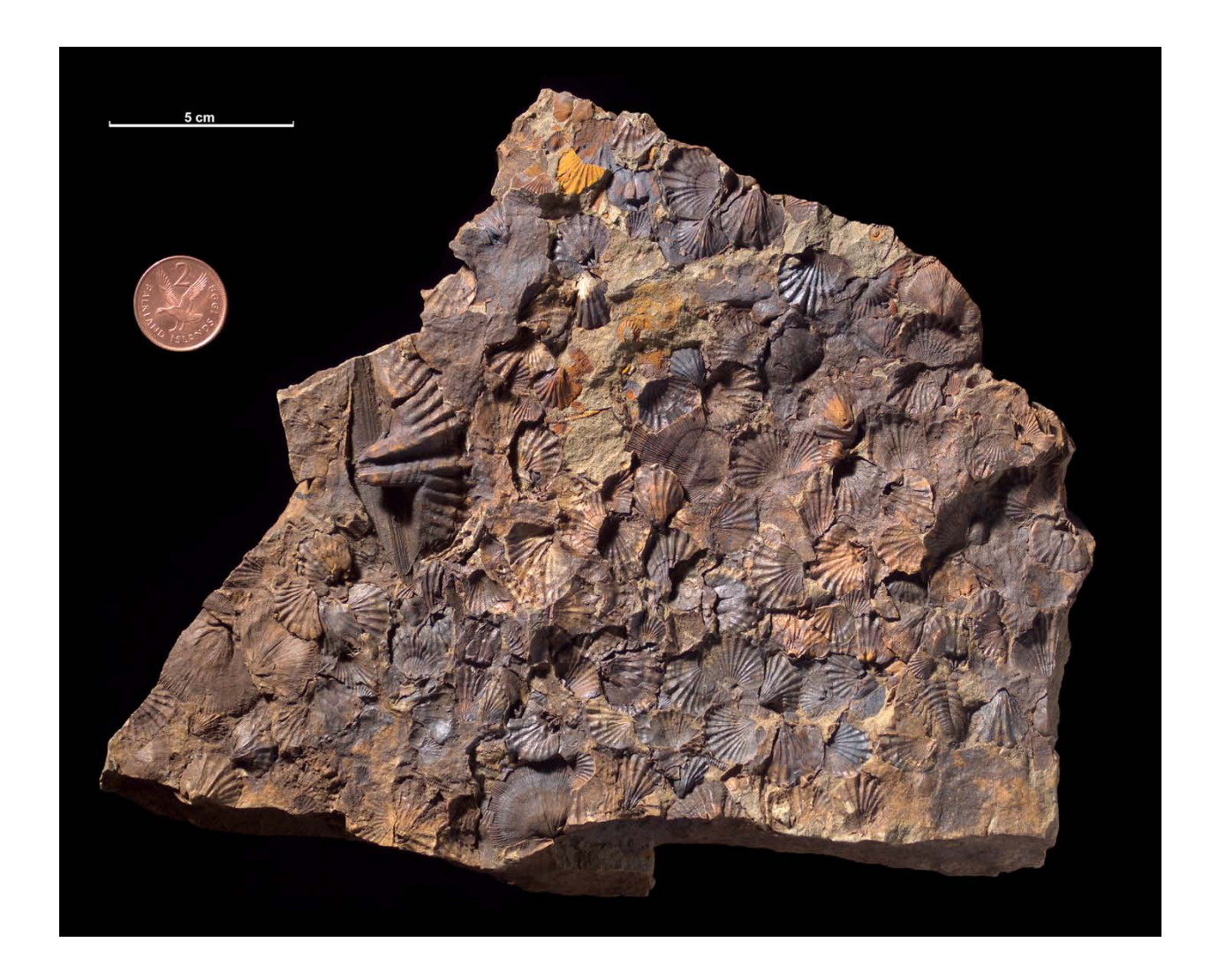
Plate 3. LX1013a. Impressions and moulds of the brachiopod Australocoelia palmata , with one large example of Australospirifer hawkinsii and the thorax and pygidium of a small calmoniid trilobite. Devonian, Fox Bay Formation. Saddle Quarry, West Falkland [51° 38' South, 59° 52' West]. BGS image numbers P549540,1 and P549543. Illustrated in figure 13 of Stone and others (2005). Coin is 2.5 cm in diameter.