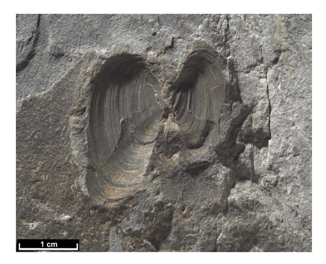
Plate 9. LX1010b. Concave impression of a splayed pair of conjoined ("butterflied") bivalve shells: Palaeanodonta cf. P. dubia (Amalitsky). Rory's Creek, Lafonia, East Falkland [51° 55' 44" South, 58° 53' 48" West]. BGS image number P573117. Illustrated in figure 38 of Stone and others (2005).