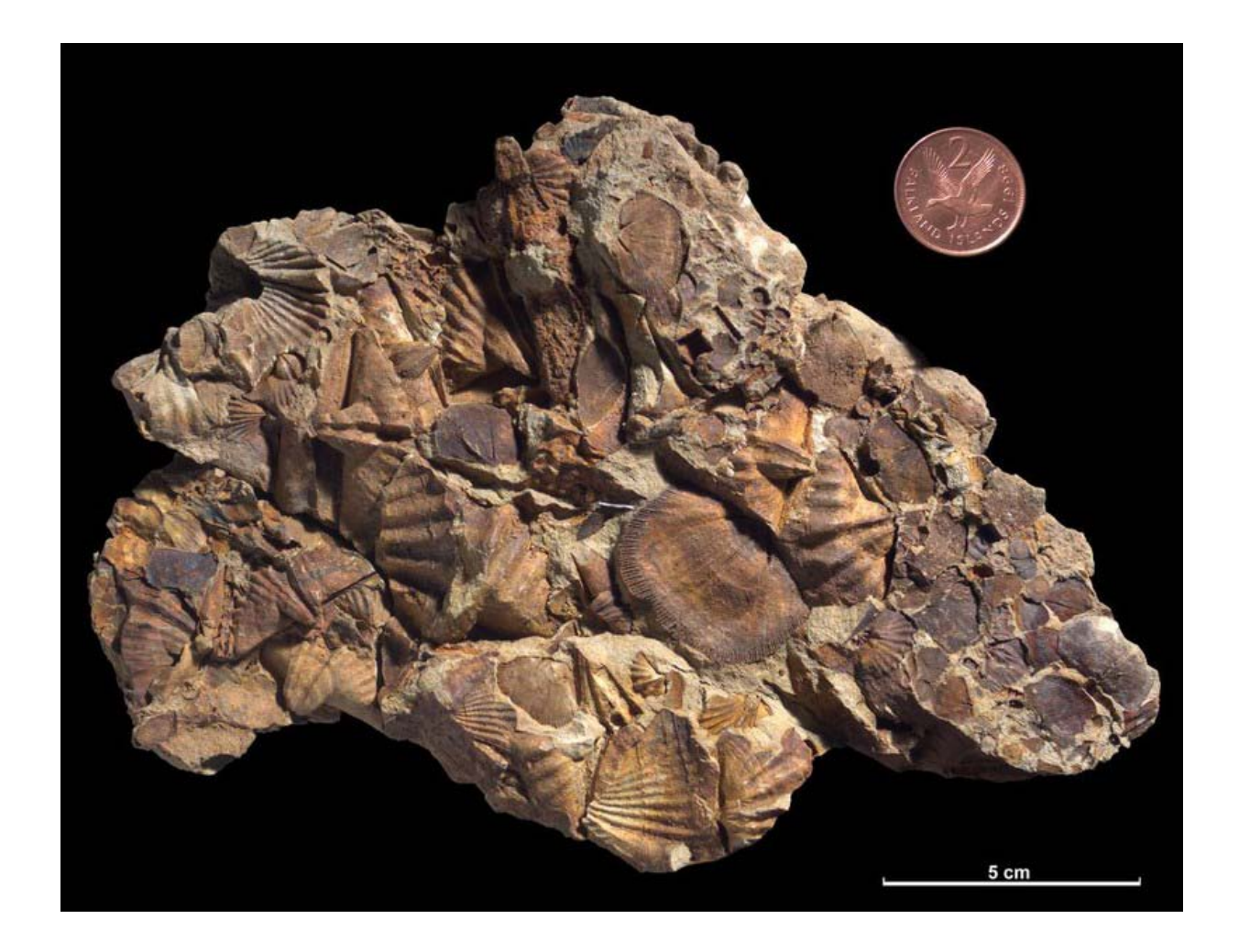
Plate 2. LX1012. Various impressions and moulds mostly of the brachiopods Schellwienella sulivani and Australospirifer hawkinsii with a few examples of Australocoelia palmata ; crinoids are also present. Devonian, Fox Bay Formation. Canard Cove, Port Louis Harbour, East Falkland [51° 33' South, 58° 09' West]. BGS image number P549542. Illustrated in figure 13 of Stone and others (2005). Coin is 2.5 cm in diameter.