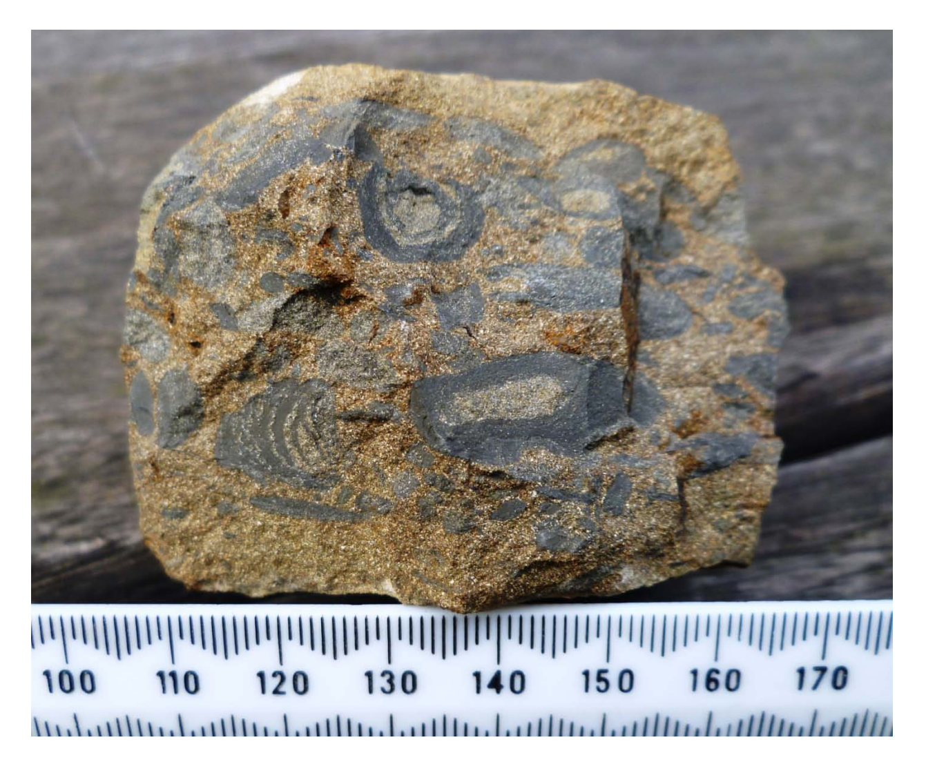
Plate 7. LX1026. Bioturbated Fox Bay Formation sandstone with large, concentrically segmented burrows. Port Howard, West Falkland. [51° 36' South, 59° 31' West]. Scale in mm.