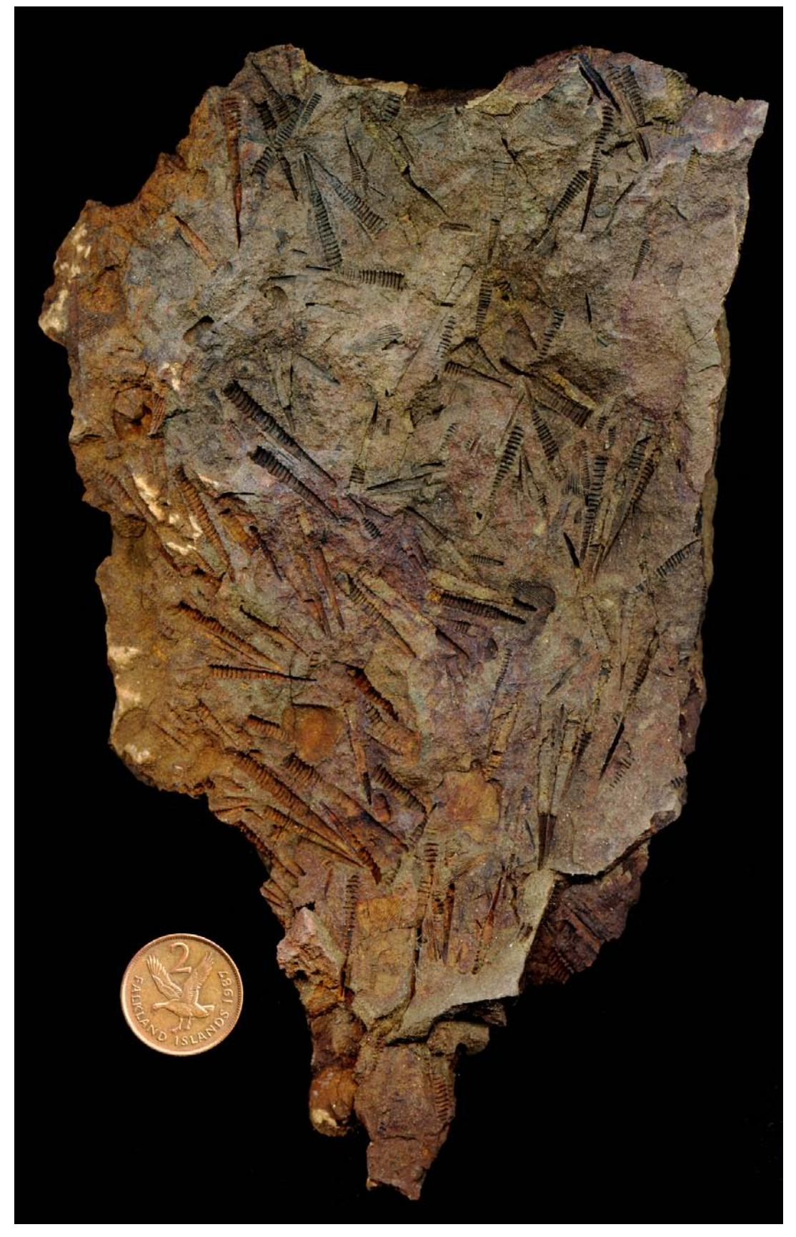
Plate 6. LX1018. The impressions of tentaculitids and a few brachiopods, mostly Schellwienella sulivani . Devonian, Fox Bay Formation. Geordies Valley, Port Salvador, East Falkland [51° 31' South, 58° 13' West]. BGS image number P511896. Illustrated in figure 22 of Stone and others (2005). Coin is 2.5 cm in diameter.