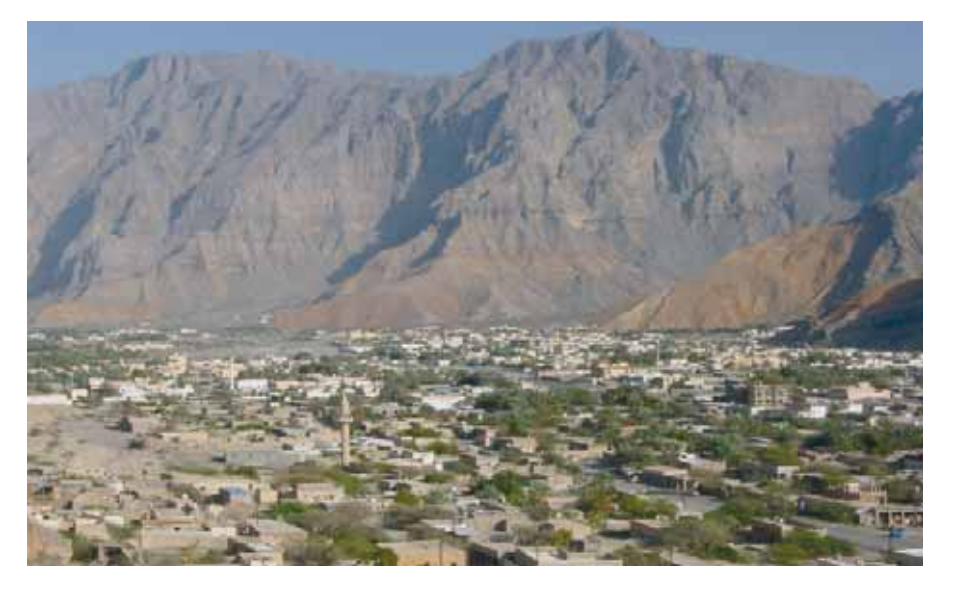
The grey Mussandam Limestone Group overlying the orange ferruginous Ghalilah Formation.

The largest part of the mountain area is formed by the UAE–Oman ophiolite, a huge slice of Indian Ocean crust that was pushed up on to the margin of the Arabian shield during Late Cretaceous