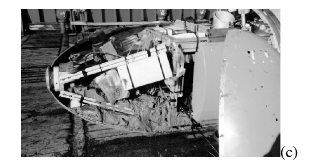
Figure 1 (a) ROV manipulator clearing the recovery line away from the Autosub prior to recovery from under an overhang on an undersea cliff in the Strait of Sicily, (b) The ROV control room of Subsea Viking showing the stranded Autosub on the screens and (c) on recovery, the mud-filled nose of the vehicle (Photographs by Andy Webb with permission).