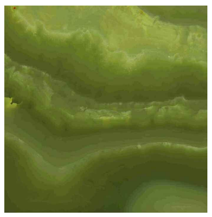
Figure 2. Helmand green onyx, Helmand Province.