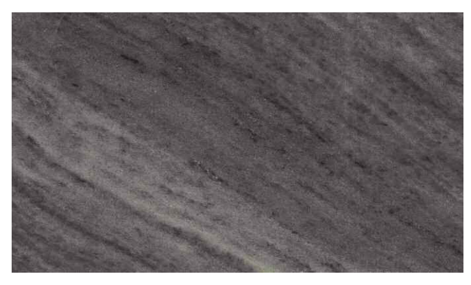
Figure 4. Wardak grey marble, Wardak Province.